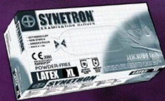
1 Synetron Powder Free Latex