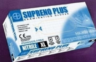
2 Supreno Plus Powder Free Nitrile

CAUTION (LATEX) : THIS PRODUCT CONTAINS NATURAL RUBBER LATEX (LATEX) WHICH MAY CAUSE ALLERGIC REACTIONS. SAFE USE OF THIS GLOVE BY OR ON LATEX SENSITIZED INDIVIDUALS HAS NOT BEEN ESTABLISHED. CAUTION (SYNTHETIC): COMPONENTS USED IN MAKING THESE GLOVES MAY CAUSE ALLERGIC REACTIONS IN SOME USERS. FOLLOW YOUR INSTITUTION'S POLICIES FOR USE.