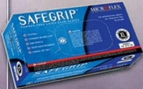
1 Safe Grip Powder Free Latex