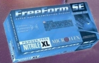
2 Free Form Powder Free Nitrile